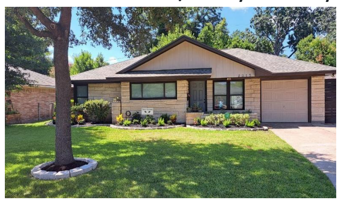
2015 Wilde Rock