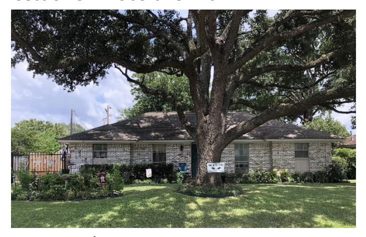
3022 Maple Grove

Judging for the SFCC Yard of the Month Contest is done on the first full weekend of every month and will continue through September. Every home in Shepherd Forest is eligible to become a winner.