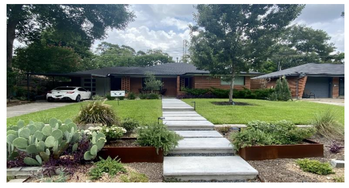
1126 West 31st