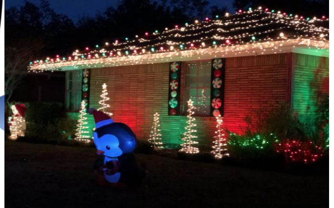
Second Place - 943 Stonecrest – The Barrett Family