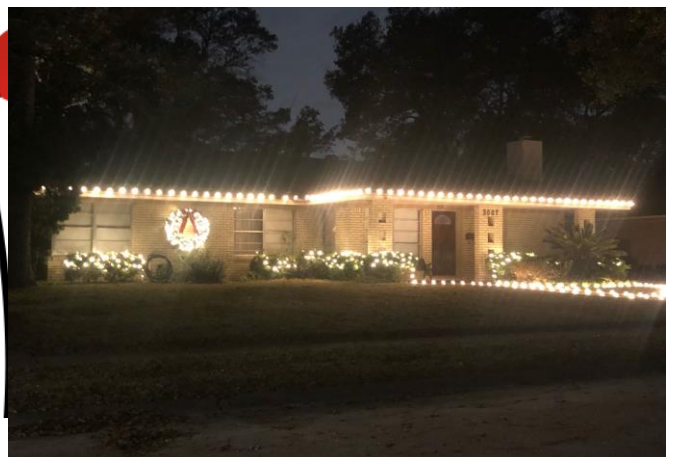
Second Place –3007 Stally The Tompkins Family