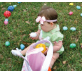
THE ANNUAL PICNIC, EASTER EGG HUNT AND CHRISTMAS PARTY ARE JUST SOME OF THE PROGRAMS SUPPORTED BY YOUR SFCC MEMBERSHIP DUES.

Don't toss out that extra flyer and envelope you found in this month's newsletter – it's the Membership Application to join the Shepherd Forest Civic Club for 2019. It's a bargain at only $20, and these funds go towards all of the functions the Civic Club performs for its members – the Monthly Newsletter, delivered directly to your door, Social Events, such as bi-monthly Social Meetings, the Annual Picnic, Easter Egg Hunt and Christmas Party, Children's Programs, Beautification Efforts, Deed Restriction Enforcement, and so much more. All residents are encouraged to join - the more people we can count as members, the more resources we have to make our community a better place to live.