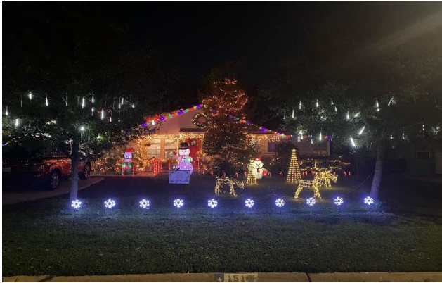
The Eddington Family