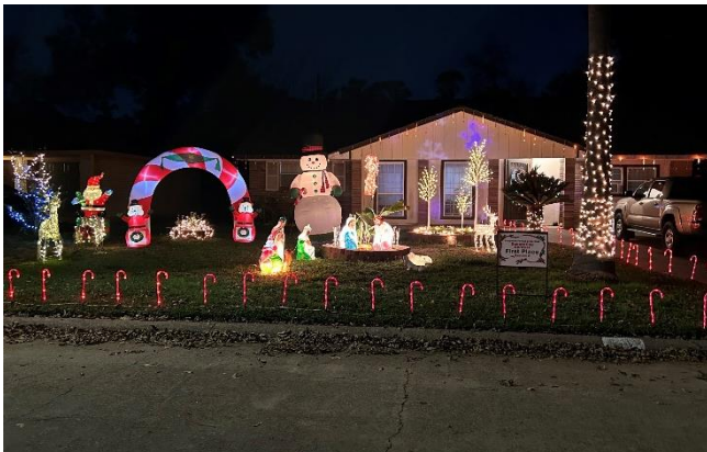
The Sibouyeh Family