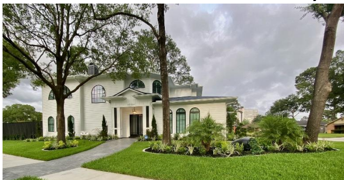
1307 West 31 st