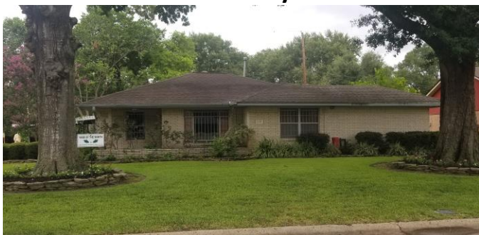
2218 Wilde Rock