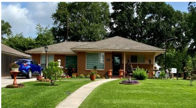
Rudy and Dolores Palomo - 1102 W. 30th