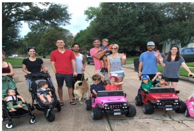
A few members of the Section 3 Stroller Brigade !